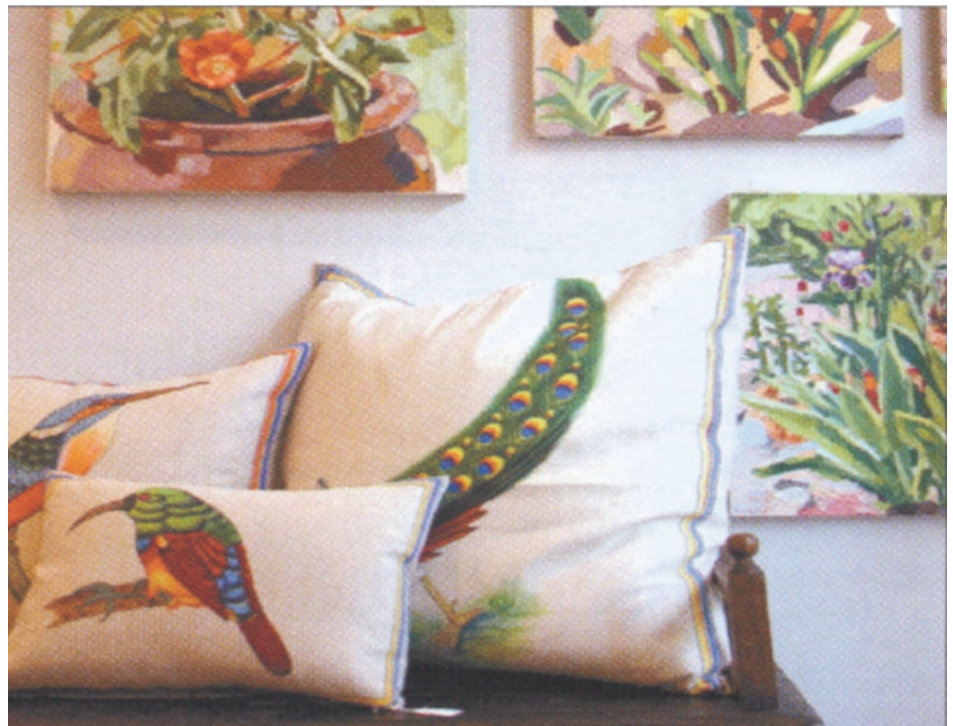
Above, fanciful pillows and artwork at Homeward Bound.