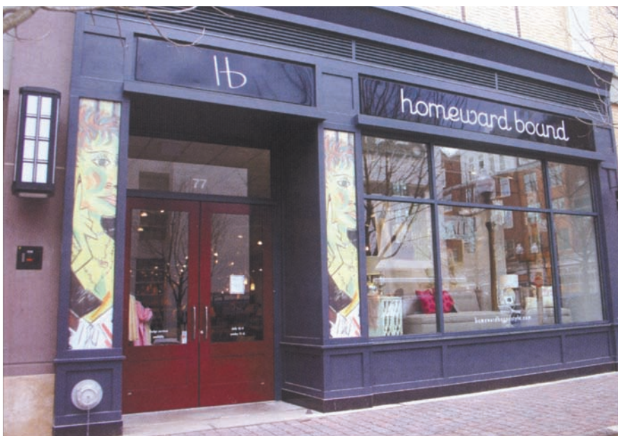
Top, an inside-out view at the new Homeward Bound store in West Hartford, Conn. Middle, jewelry, and above, the exterior.